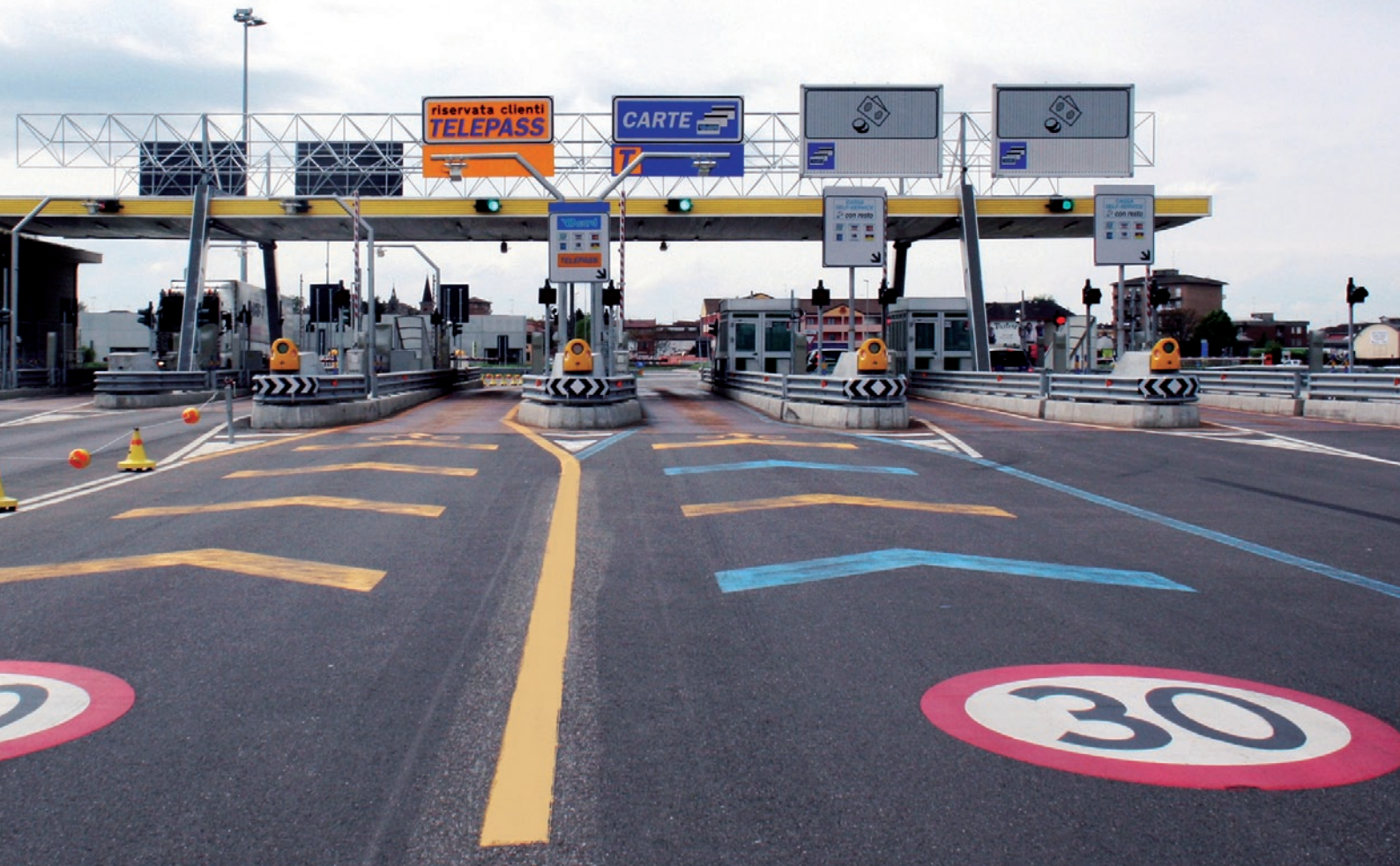
TOLL STATION INTERCOM